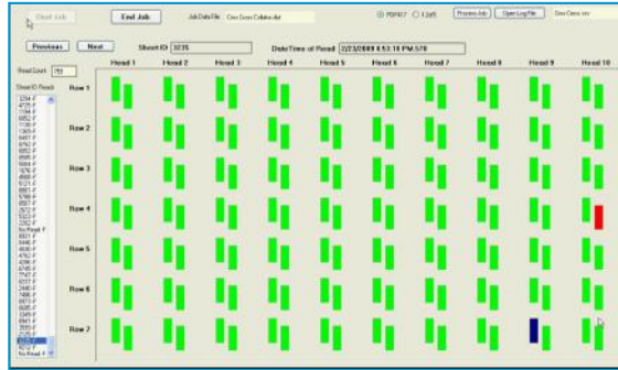
DISCOVERY PDV GUI using colour to represent status of each item in real-time